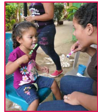
Each year 125 more preschoolers and 10 mothers enthusiastically learn about dental hygiene (see p. 5).

Education, improved health, and economic and emotional stability are key to transitioning from extreme poverty. Project Opportunity addresses all four in small, but significant ways.