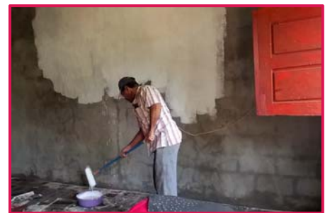
Parents wanted to brighten up the gray concrete walls at "Dulce Sonrisa". Now they are green and yellow.

Each year parent committees submit proposals to PO for improvement and maintenance projects. PO works with 3 preschools in adjacent neighborhoods, one we built in 2011. Our goal in the collaboration is to facilitate parent participation at the preschool and to accomplish a needed improvement.