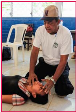
PO's popular "Salva un vida" classes really do save lives - at least 13 that we know about (see p. 5).