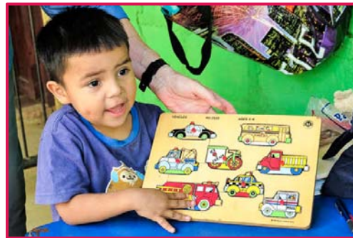
Preschoolers with special needs benefit from our individualized hands-on approach: home visits, personalized attention, diagnostic evaluations and consultations with teachers (see p. 4).