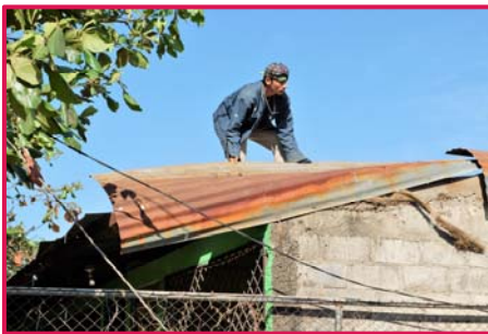
PO paid for the materials to replace leaky tin roofs at 2 preschools, parents did the work.