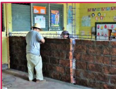
This new wall divides the 3- and 4-year-old classrooms at "Las Tortuguitas".