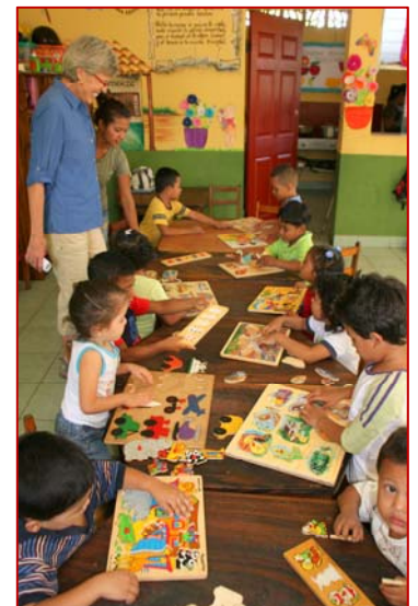
How thrilling and heart-warming it is to see donated puzzles from the US put to such good use!