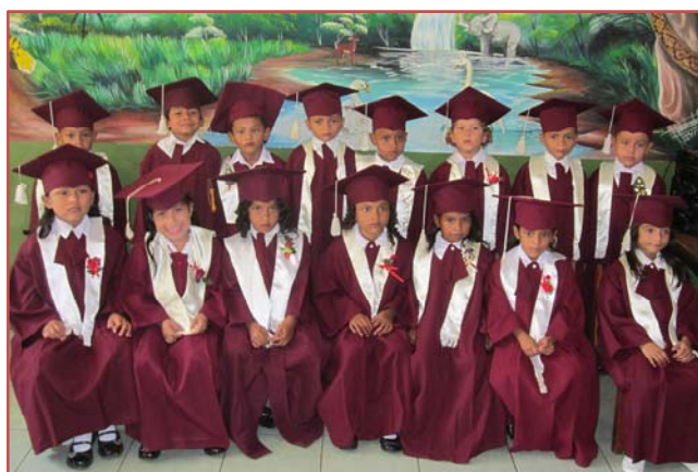
In December 2012, fifteen 5-year olds graduated from the community preschool, Gotitas de Esperanza (Little Drops of Hope), constructed by Project Opportunity in 2011. In true Nicaraguan style, the graduation was a gala family and community celebration - an appropriate launch to first grade.