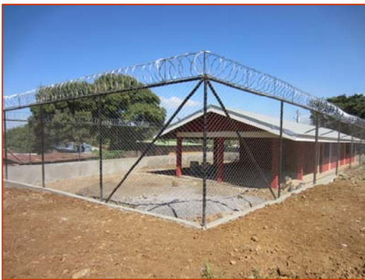
This protective fence/wall/serpentina around the preschool has been a community goal since the school was built. Now children can play safely outside and school supplies are secure inside.

After 5 years and many visible accomplishments, Project Opportunity has developed an impressive track record. Other nonprofits see the quality and scope of our efforts and want to help with community projects. Leveraging our talents in proposal writing, networking, facilitating community involvement and construction management - we gain the respect of other organizations who then contribute so that we all may better achieve shared goals.