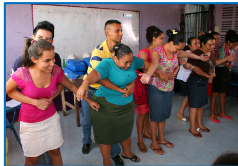
Teachers practice the Heimlich. Many participants share this life-saving technique with family members and in their communities and churches. Below: High schoolers learn CPR for infants.