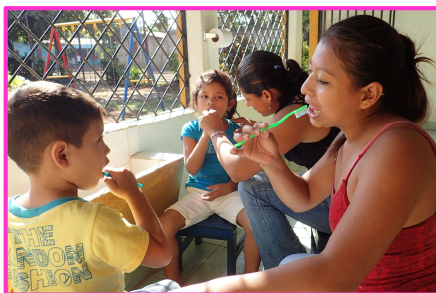
Dental hygiene mothers often want to continue with PO job training or request help with job search skills.