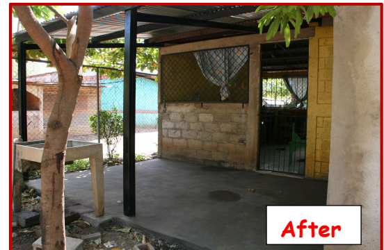
PO responded to Mercedes' request and collaborated with preschool families to build this patio, now a dedicated shaded play and nap area for the toddlers.