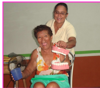
Dental hygiene classes for parents have their lighter moments. Here a grandmother covets our demo teeth.