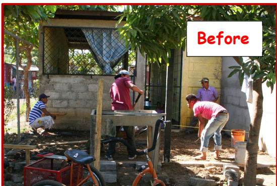
This area between the bodega (last year's project) and the toddler classroom was rocky and baked in the sun.