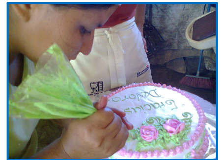
In 2015, PO helped Xochilt learn to decorate cakes, then with accounting skills and a purchase of supplies. Now she can hardly keep up with cake orders and she sells smoothies and other baked items.