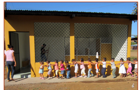
With a child-level sink and 4 faucets, low urinal and 4 toilets - the bathroom is the pride of the community. Ever resourceful Mercedes used the left over paint to paint the school too.