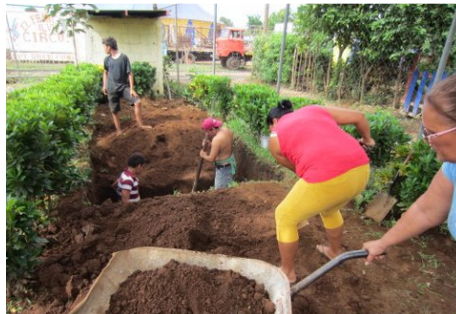
Families collaborated by digging the enormous holes for the septic system, moving dirt and refilling one of the old pit latrines.